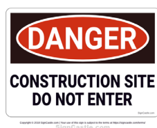
PROHIBITORY (Black & Red) Do Not