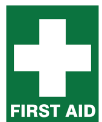
SAFE (Green & White)