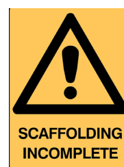
CAUTION (Black & Yellow) Be careful