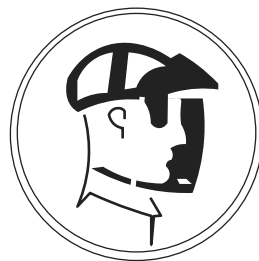
Safety helmet must be worn in this area