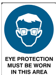
MANDATORY (Blue & White)

The signs must comply with AS 1319 Safety signs for the occupational environment [Occupational Safety and Health Regulations 1996, regulation 3.11].