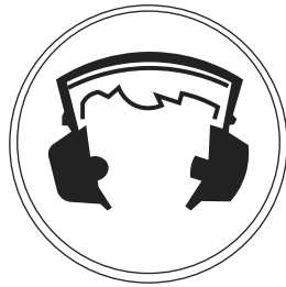
Hearing protection must be worn in this area