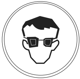
Eye protection must be worn