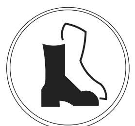
Foot protection must be worn

*Follow other mandatory signs displayed at site e.g. No Access